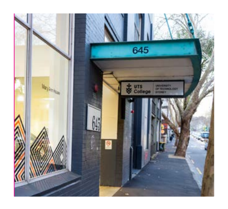
Classrooms and Student Common Area

Harris Street Campus 645 Harris Street Ultimo, Sydney